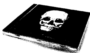
The Palominos Internazionale Goodnight Loving Trail EP